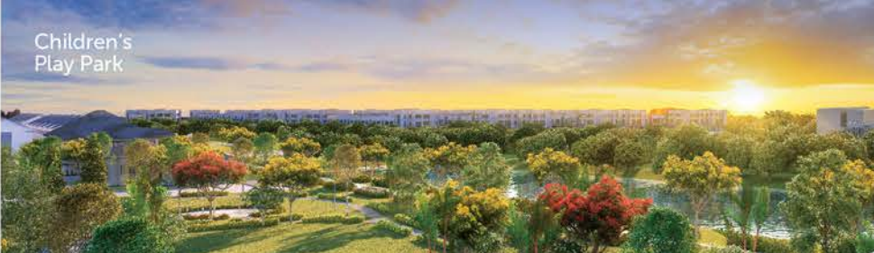
Children's Play Park